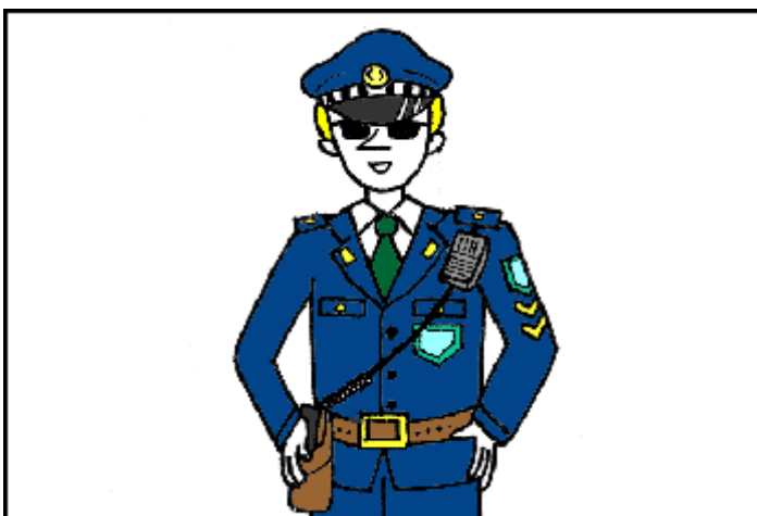
a police officer